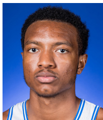
34 | Wendell Carter, Jr. F | Fr. | 6-10 | 259 Atlanta, Ga.