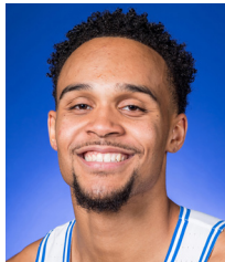
2 | Gary Trent, Jr. G | Fr. | 6-6 | 209 Columbus, Ohio