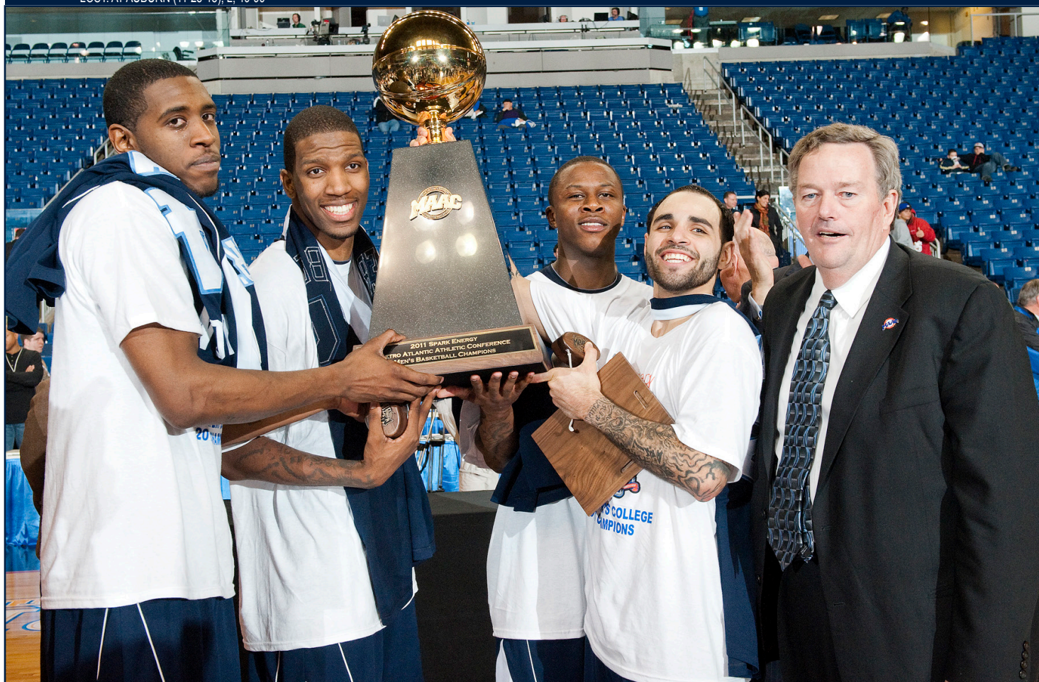
*Saint Peter's last won a MAAC Men's Basketball Championship in 2011