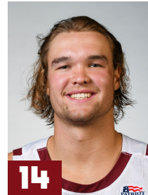
14 Keegan Records 5th | F | 6-10 | 250 South Kingstown, R.I.